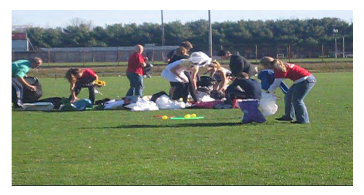
Both families participate in a relay race to find their wedding attire during lunch/activity period.